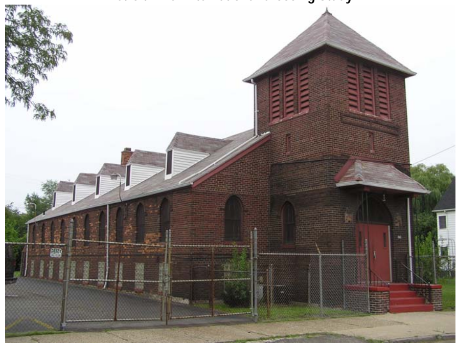
Figure 5-3A St. Paul African Methodist Episcopal Church, 579 South Rademacher Street Detroit River International Crossing Study