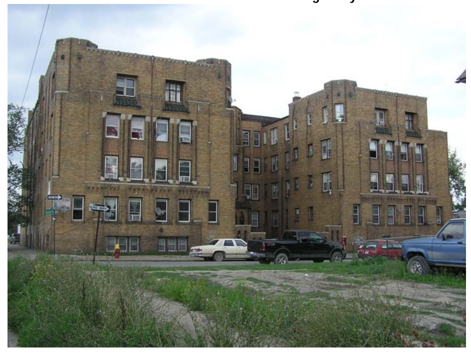
Figure 5-1A Berwalt Manor Apartment Building, 760 South Campbell Street Detroit River International Crossing Study