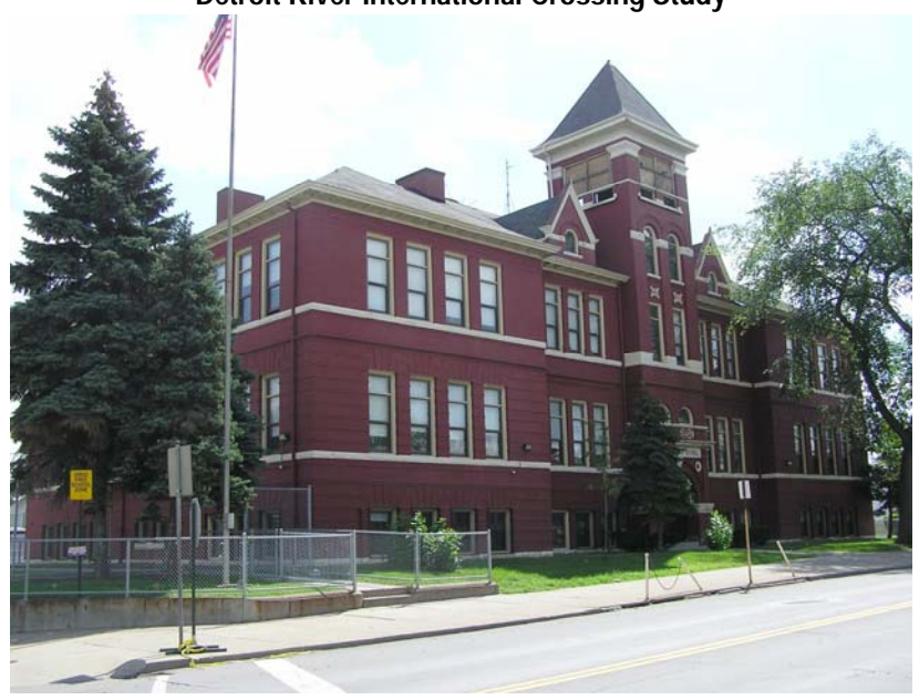
Figure 5-4A Frank H. Beard School, 8840 North Waterman Street Detroit River International Crossing Study