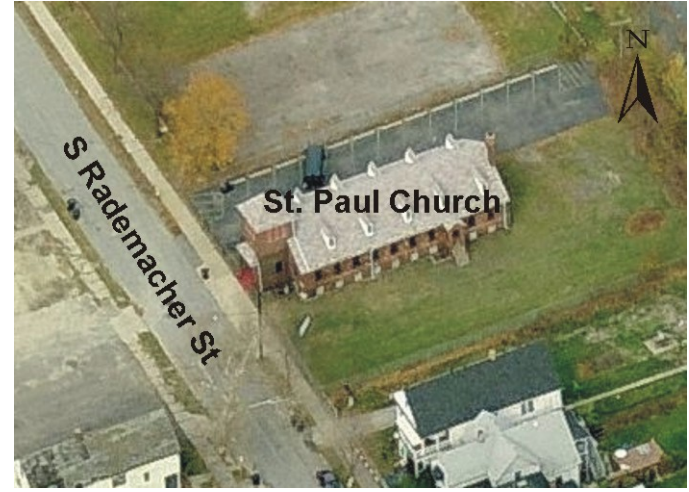
Figure 5-3B Aerial View of St. Paul AME Church Detroit International Crossing Study