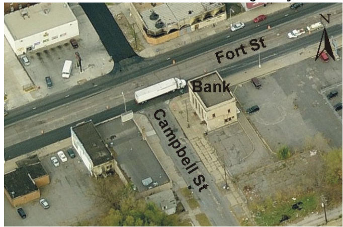
Figure 5-5B Aerial View of Detroit Savings Bank/George International Building Detroit River International Crossing Study