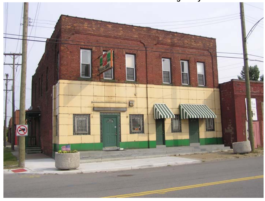
Figure 5-2A Kovacs Bar, 6982 West Jefferson Avenue Detroit River International Crossing Study