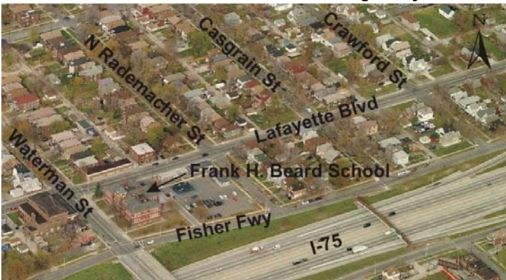
Figure 5-4B Aerial View of Frank H. Beard School Detroit River International Crossing Study