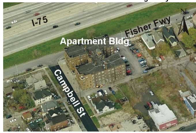
Figure 5-1B Aerial View of Berwalt Manor Apartment Building Detroit River International Crossing Study